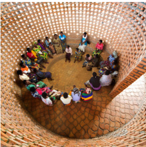
MUSEUM OF DESIGN ATL