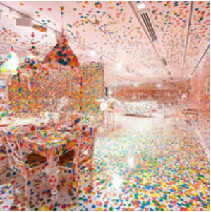
HIGH MUSEUM OF ART